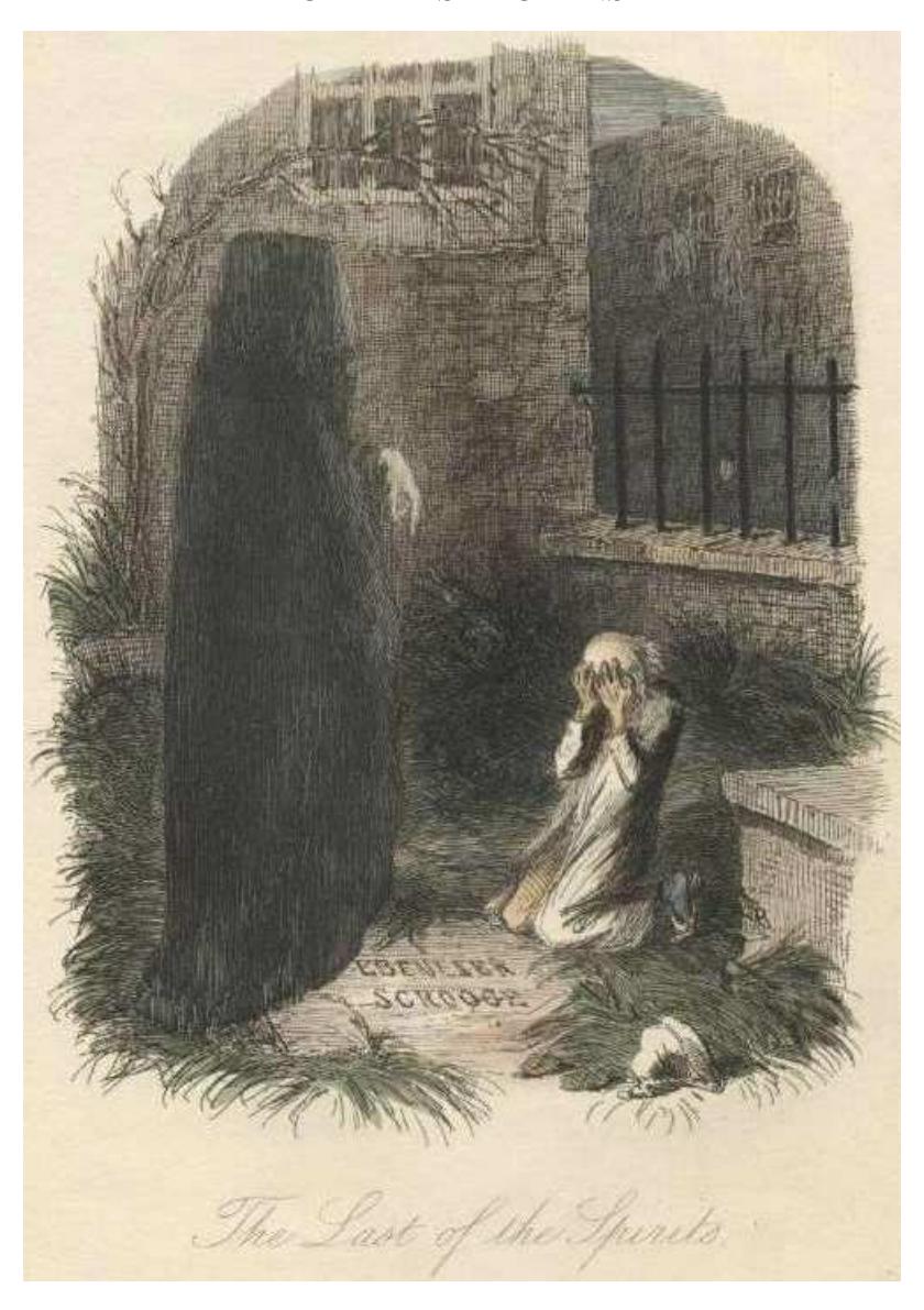
The Last of the Spirits