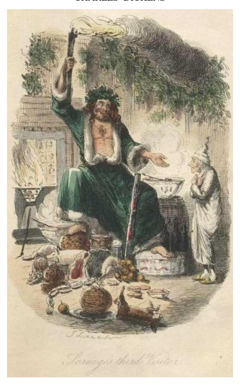
Scrooge's Third Visitor